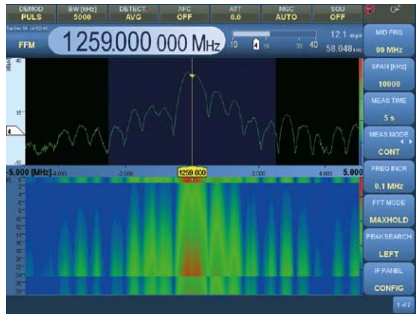
Detection and analysis of a radar pulse

To enable more in-depth analysis of the signal spectrum and signal environment, the receiver is equipped with an IF panorama. The current receive frequency is at the center of the spectrum display. The span can be set between 1 kHz and 20 MHz for optimal adaptation to the task at hand. MINHOLD, MAXHOLD and AVERAGE displays are also possible, allowing an even broader scope of applications.