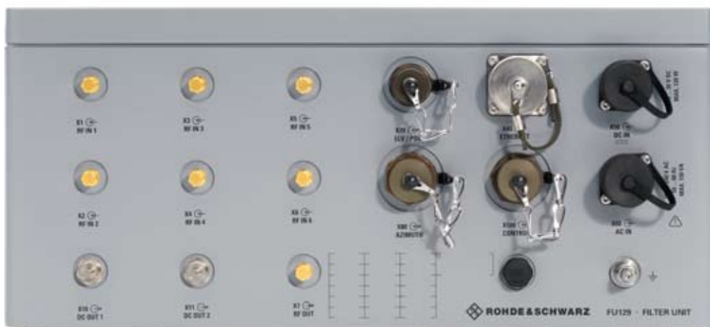
R&S®FU129 front view.